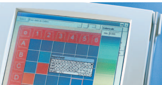
Convenient onboard operation.

Look no further – the Sunrise Absorbance Reader has it all