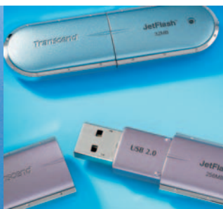
USB stick for data storage.