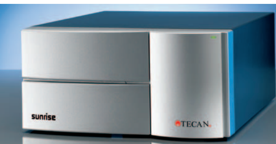
Sunrise Remote Control.