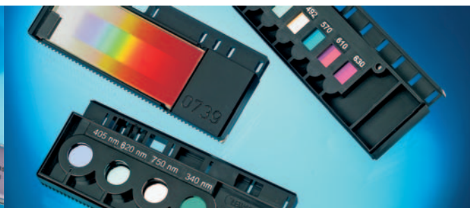
4 filter, 6 filter or free wavelength selection filter.

The versatile Sunrise microplate absorbance reader, gives you all the features you need for many different applications for diagnostic, pharmaceutical as well as for research laboratories. The NEW generation Sunrise Touchscreen Color adds a new dimension to user-friendliness and computer-independent data processing.