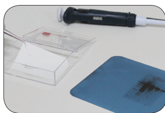
Beautiful Western blots every time