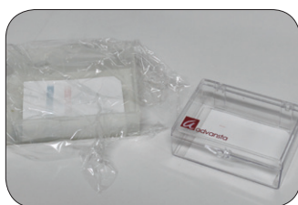
Save antibody and buffer by using the smallest tray that can hold your blot