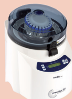
Precellys® 24 for high throughput