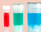
Lysing kits consumables