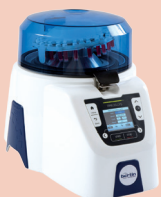
Precellys® Evolution Super Homogenizer